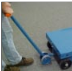
203-0905: T-Bar Transport Kit