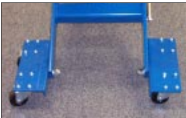
203-0903: Caster Kit